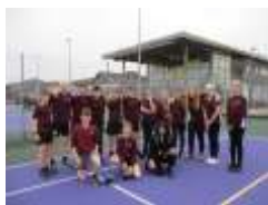
Year 8 Mixed Handball Tournament at QE