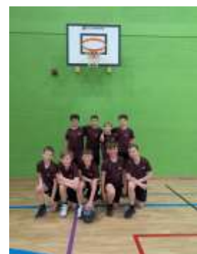
Year 8 Boys Basketball