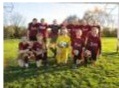
Years 5&6 Girls Football