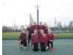
Year 5&6 Netball