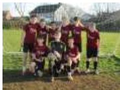
Year 7 Boys Football