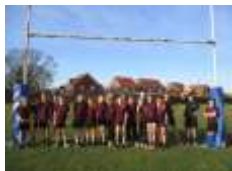
Years 5 & 6 Introduction to Rugby Event

Here's a very brief overview of all of the events that have taken place. For more details and for even MORE sporting news, please click here for our LMS Extra Newsletter