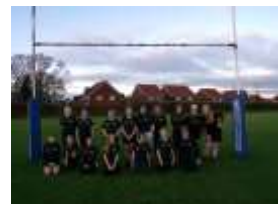
Year 8 Girls Rugby