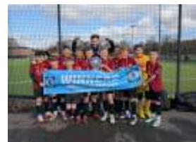
Year 6 Boys Football PEDSSA Trophy Winners